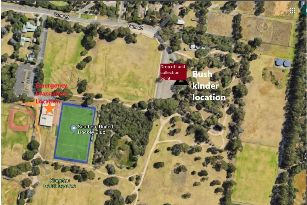
Risk assessment and management – Bush Kinder Program